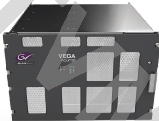
Vega 700 sample picture

Condition is like new – all parts are coming out of the box!