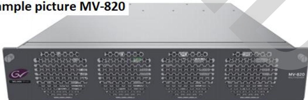
sample picture MV-820