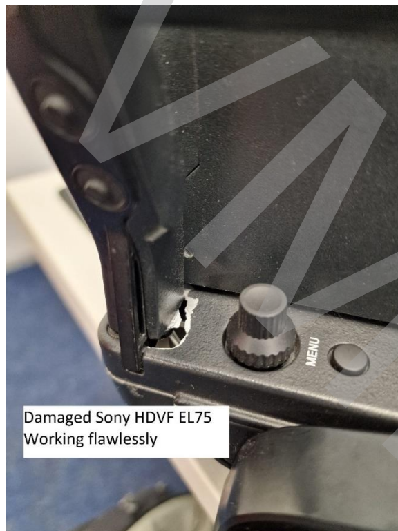
Damaged Sony HDV EL75 Working flawlessly