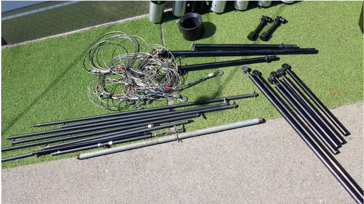
included pan bars please note: there is no tripod included for these pan bars - available on request