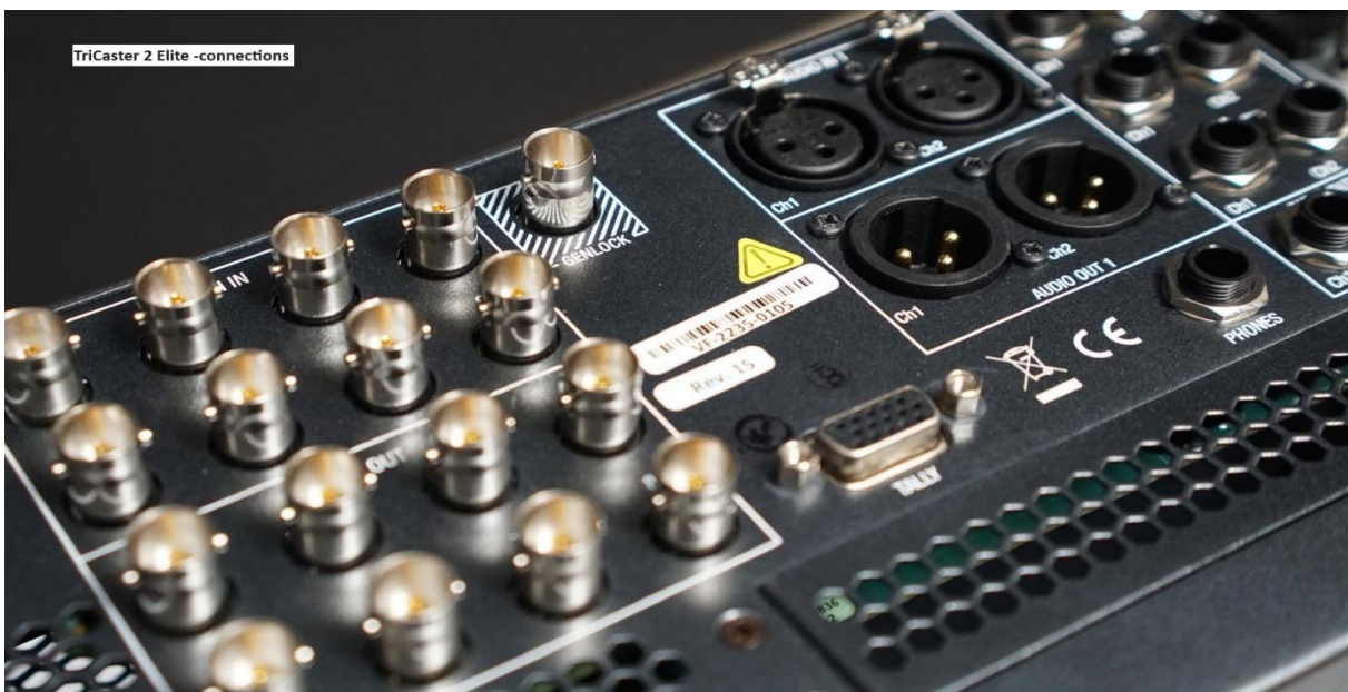
TriCaster 2 Elite -connections