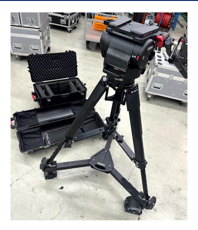
Price on request: Excl. VAT Excl. shipping & insurance costs Excl. custom fees

Tripods are in very good condition Tripods have been built in 2019