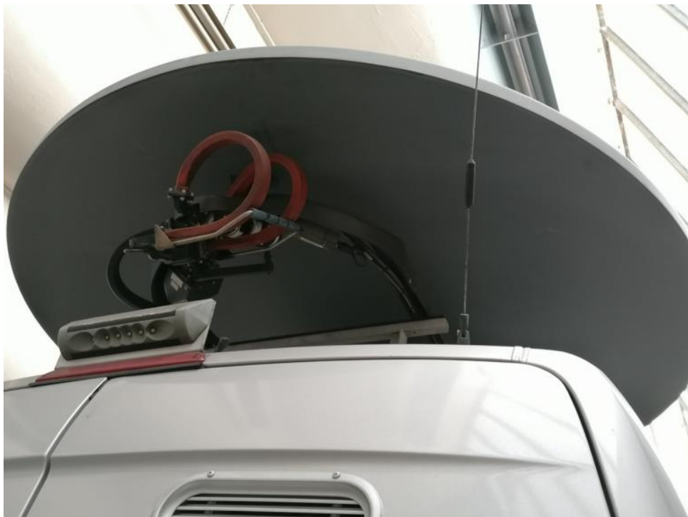
Used HD SNG Mercedes Sprinter – right hand drive vehicle