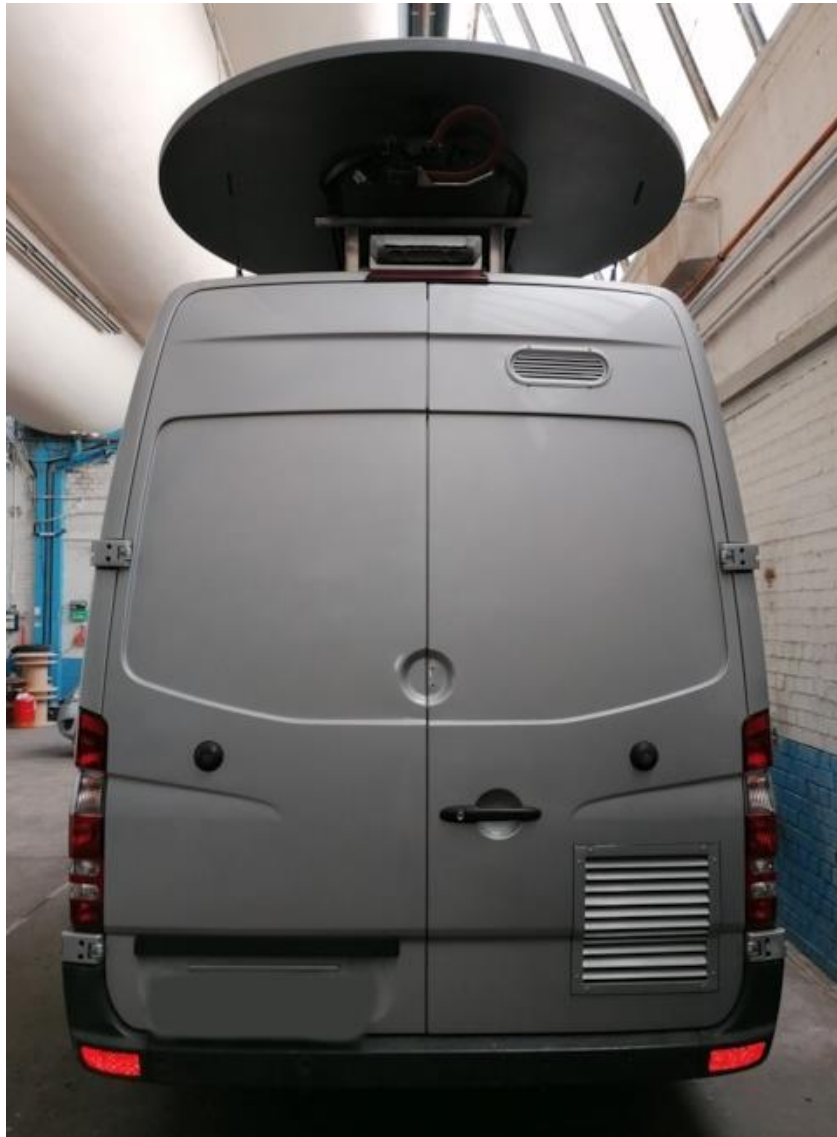
Used HD SNG Mercedes Sprinter – right hand drive vehicle

Paradeisergasse 9 • 9020 Klagenfurt, Austria Tel.: +43 463-90 8000 • Fax: +43 463-90 8000-99 e-mail: stvmd@stvmd.com • http://www.stvmd.com